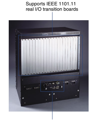
Intelligent alarm module, detecting system power, fan speed and CPU temperature