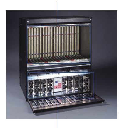
AC or DC ATX 1960 W+280 W redundant (7+1) power supplies

21-slot backplane supporting 17 nodes, 1 system, 2 fabric, and 1 CMM (chassis management module)